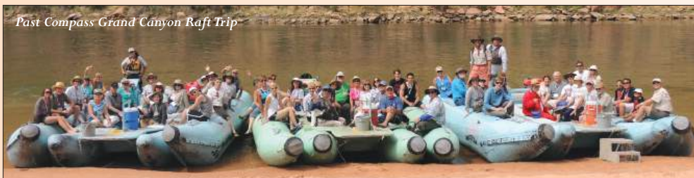
Past Compass Grand Canyon Raft Trip

Register at Compass.org • Clip & Mail • Register by Phone 208-762-7777 • Or text picture of completed registration form to (208) 660-3333.