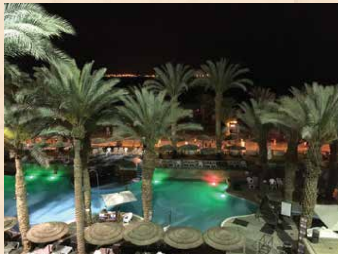
View from hotel room in Eilat

This is one fabulous Holyland trip! God has opened a door of opportunity for us to travel to Israel at this time and we can't wait to see the sights and smell the flowers in God's special place on earth. If you've got the time and the sheckels, pray about joining us!