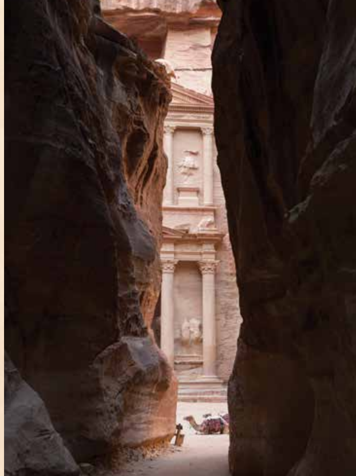
First view of the Treasury in Petra from the Siq.

We'll take a relaxing Red Sea Lunch Cruise on a private yacht, The Paradise. If you're up to it, there's optional swimming and snorkeling in the clearest water on the planet. Or just kick back and relax for a lunch you'll never forget!