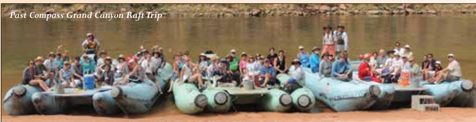
Past Compass Grand Canyon Raft Trip