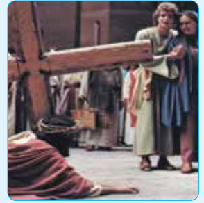
Scenes from the 2010 performance of the Passion Play.