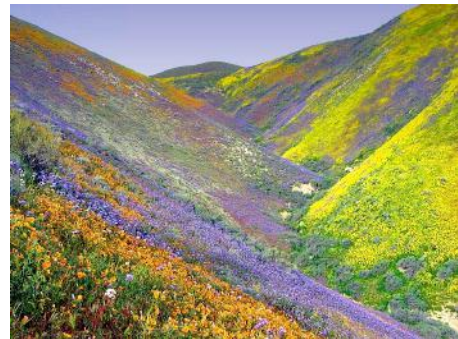
The desert is blooming in Israel

Since the Jews began returning in 1917, and especially since 1948 when the United Nations gave them official Nation-status, Israel has been refurbishing the land. They've drained the swamps, irrigated the land and planted some 250 million trees.