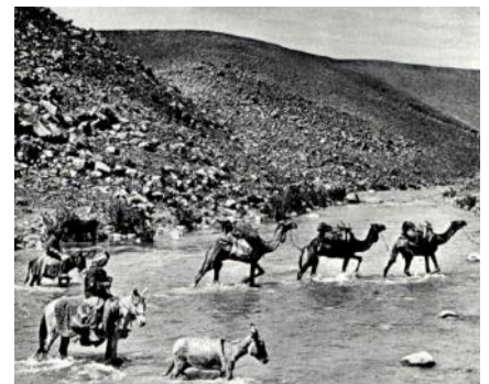
Jordan River 1913

But it's not the Arab land that is cursed, but rather the Arab people. Israel took over the same deserts and swamps beginning in 1917, land the Arabs thought useless. Land they laughingly SOLD to Israelis post-1917, thinking they were ripping off the Jews who were stupid buyers.