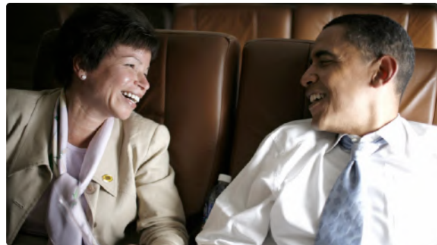
Valarie Jarrett, an Iranian born devout Muslim, is Senior Advisor to the President.

Even most of our national media seem to give credibility to destructive national policies. And I can't help but wonder about where our leadership is taking this nation as no less than seven top advisers in the White House are devout Muslims...including Valarie Jarrett who has been called the most influential woman in the world. (7)