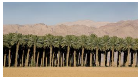
Israeli date palm trees being grown in the Jordan Valley today.

Now the Arabs are humiliated watching Israel as they've changed the landscape into such high crop yields that they now export their excess fresh food flying it daily into Europe.