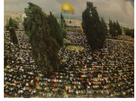
Muslims praying on Temple (Mount Moriah) in the Old City of Jerusalem

Israel is in the hot seat due to their proximity in the Middle East to all the Muslim countries. Since 600 AD, God has allowed the Muslims to grow up around them. But the Muslim war against Israel is more than a war against Israel. It is jihad against the West. Israel is simply on the front lines. Without Israel being planted so firmly in the middle east, Islamic imperialism would have moved much faster.