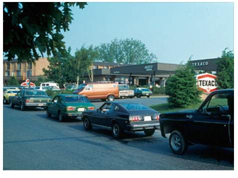
Gas Lines in the U.S. in the 1970s

Muslims are always fighting, even each other (Gen 16:10-12). Saudi jets have already begun dropping bombs in Yemen at the terrorists camps. Over 250 border towns have already had to close, including 50 schools.