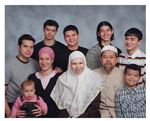
Typical Muslim Family

Muslims expect to take over the world and institute Shari'a law everywhere. Spreading out from the Middle East, Muslims have been multiplying like rabbits in Europe, averaging 6 kids per family. In France, one in ten are Muslim. Many European cities, including Amsterdam, Marseille, France and