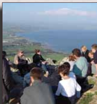
Sea of Galilee