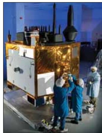
New USAF Spy Satellite

Now this will give you goose bumps. In May of 2010, the United States Air Force launched a new generation network of 12 GPS satellites with enhanced capabilities.* These new satellites orbit the earth 14 times a day and offer ultra precise, near instantaneous, and continuous information for anything they track. Among the suggested uses are: