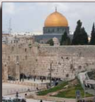
Wailing Wall/Dome of the Rock