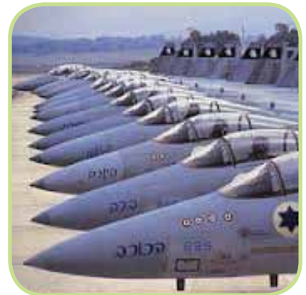
Israeli F-16 fighter jets.

But not anymore. Israel took advantage of the window of opportunity and annihilated her four nearest Arab enemies, and another five were in her sights. It was just a matter of time before Israel again pulled the trigger to finish off the once falsely proud Muslim nations as they were no match against the incredible Israeli military might.