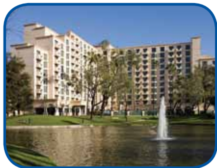
Conference location: Costa Mesa Marriott Hotel near John Wayne Airport

Join us in Costa Mesa for some awesome STEEL ON STEEL!!