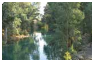
Jordan River today.

Israelis invented the drip system that enables as little as a cupful of water to bountifully nourish a