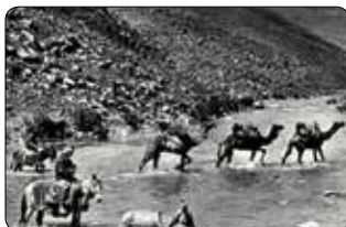
Jordan River in 1913.

One of the most amazing things we see in Israel today on our Bible trips