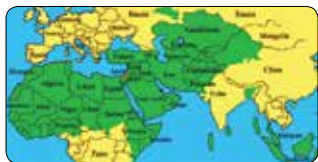
You can barely see Israel (red) in the middle of a Muslim-dominated land.

The Bible not only promised Israel would return to their God-given land, but that this tiny nation would also become a burdensome stone to the world. Hardly a day goes by that Israel's not in the news. Israel has a population of about 8 million, the Arabs about 450 million.