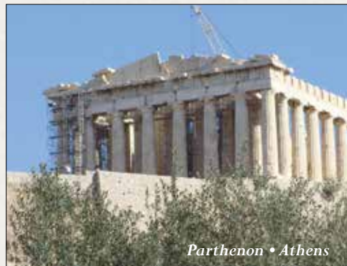
Parthenon • Athens

The land of the Bible. You've read about it, now it's time to see it with your own eyes! And once you do, you'll simply never be the same. It'll be the experience of a lifetime as you join the Resurrection cast and crew live in Israel and around the Mediterranean--together learning about the land of the Bible and turning your black and white scriptures into vivid living color.