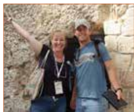
"The Empty Tomb," one of scores of Biblical sites you'll visit!

Non-Profit Org. U.S. Postage PAID Coeur d'Alene, ID Permit 166