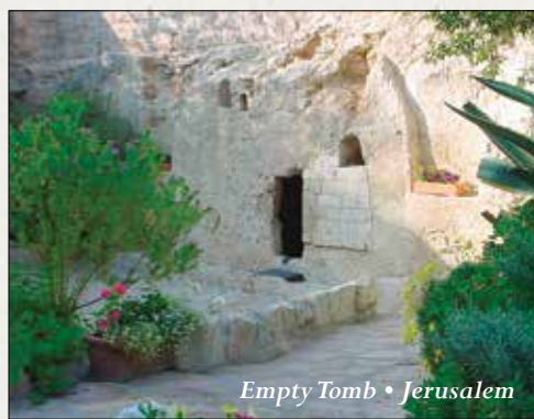
Empty Tomb • Jerusalem