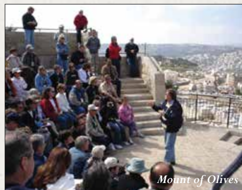
Mount of Olives

We've designed a unique itinerary visiting all the key sites in Israel like the Mount of Olives where Jesus departed the earth and where He'll return; the Garden of Gethsemane where Jesus was arrested; the Sea of Galilee where Jesus walked on the water; the Valley of Armageddon where the nations of the world will gather; the Old City of Jerusalem with the Wailing Wall ; and the Temple Mount where Jesus will reign over the earth. It's a nine day trip with days filled with scriptures, sounds and memories of God's special place on earth!