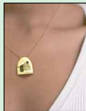
All items Sterling Silver, call for price of any item in 14K gold.

Anyone can wear a cross... but only a Believer will wear the resurrection!