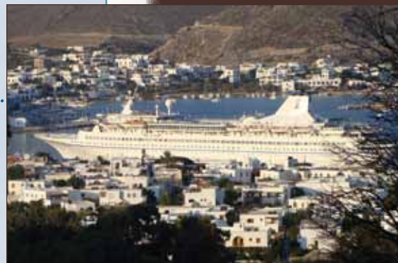
The Aquamarine—docked in Patmos on a previous Compass cruise.