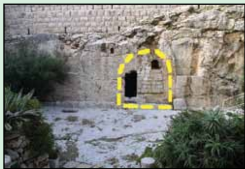
The Empty Tomb—Jerusalem

Join Today! 1-800-977-2177 www.compass.org or mail (page 7)