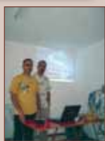
Berean School of Theology, Mauritius