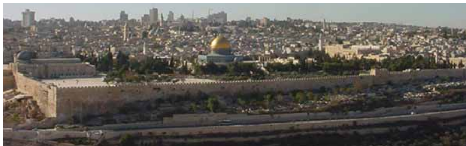
The Temple Mount where Jesus will reign for 1000 years