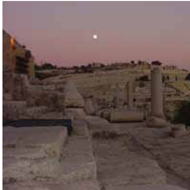
Southern Steps & Mount of Olives