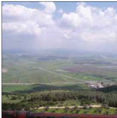
Valley of Armageddon