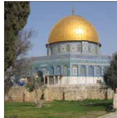
Dome of the Rock