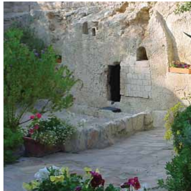
The Empty Tomb