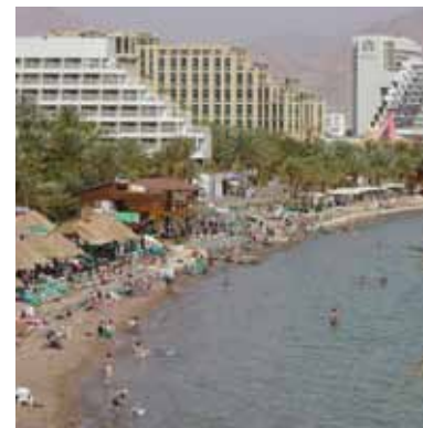
Eilat and the Red Sea