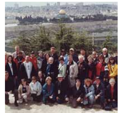
This could be you!

Join us and see all the things you read about in your Bible!