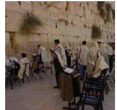
The Wailing Wall